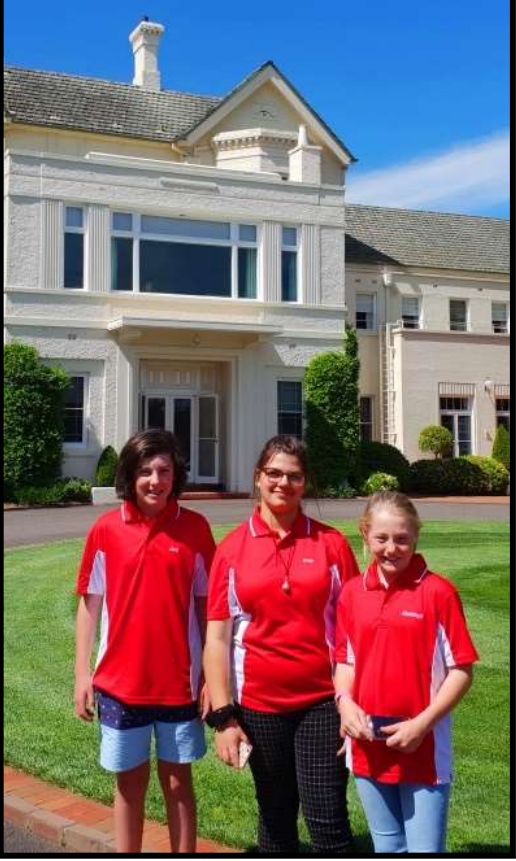
At Kersbrook Primary School we value Respect, Responsibility, Confidence and Resilience