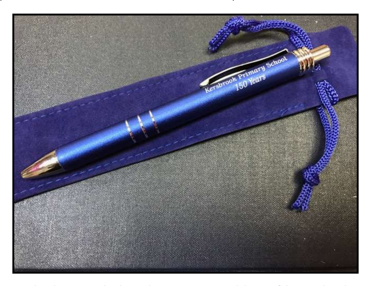
At Kersbrook Primary School we value Respect, Responsibility, Confidence and Resilience